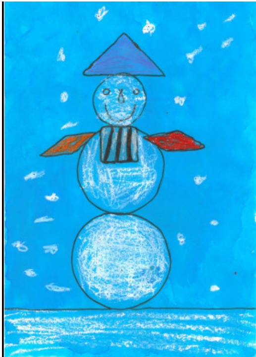
By Micah Basilisco