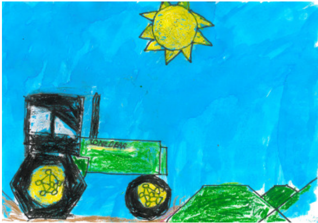
By Luke Bickley